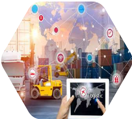
Logistic & Supply