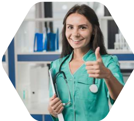
Medical & Healthcare